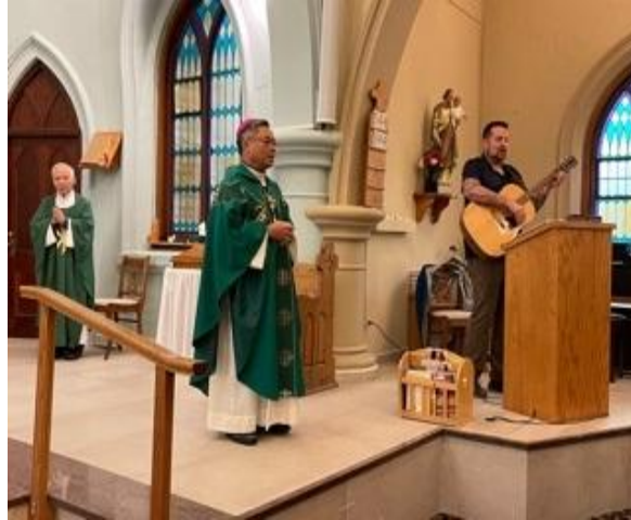
Bishop visiting SJS